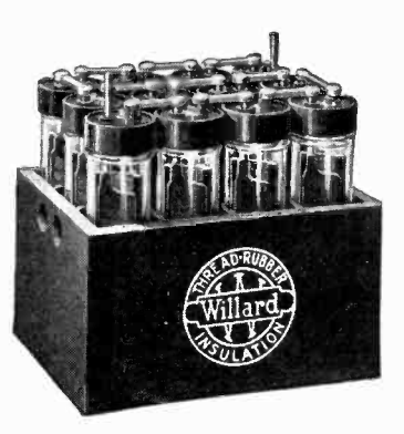
The Willard Radio "B" Battery is a 24-Volt rechargeable battery. Glass jars —Threaded Rubber Insulation