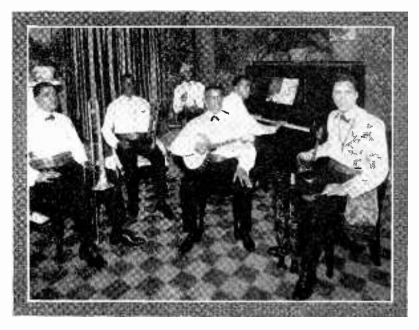
The Broadway Syncopators

(KDKA Program continued from page 4.) Wednesday, July 12, 1922